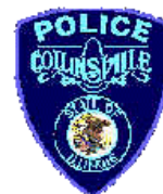
Collinsville Police Department