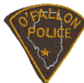
O'Fallon Police Department